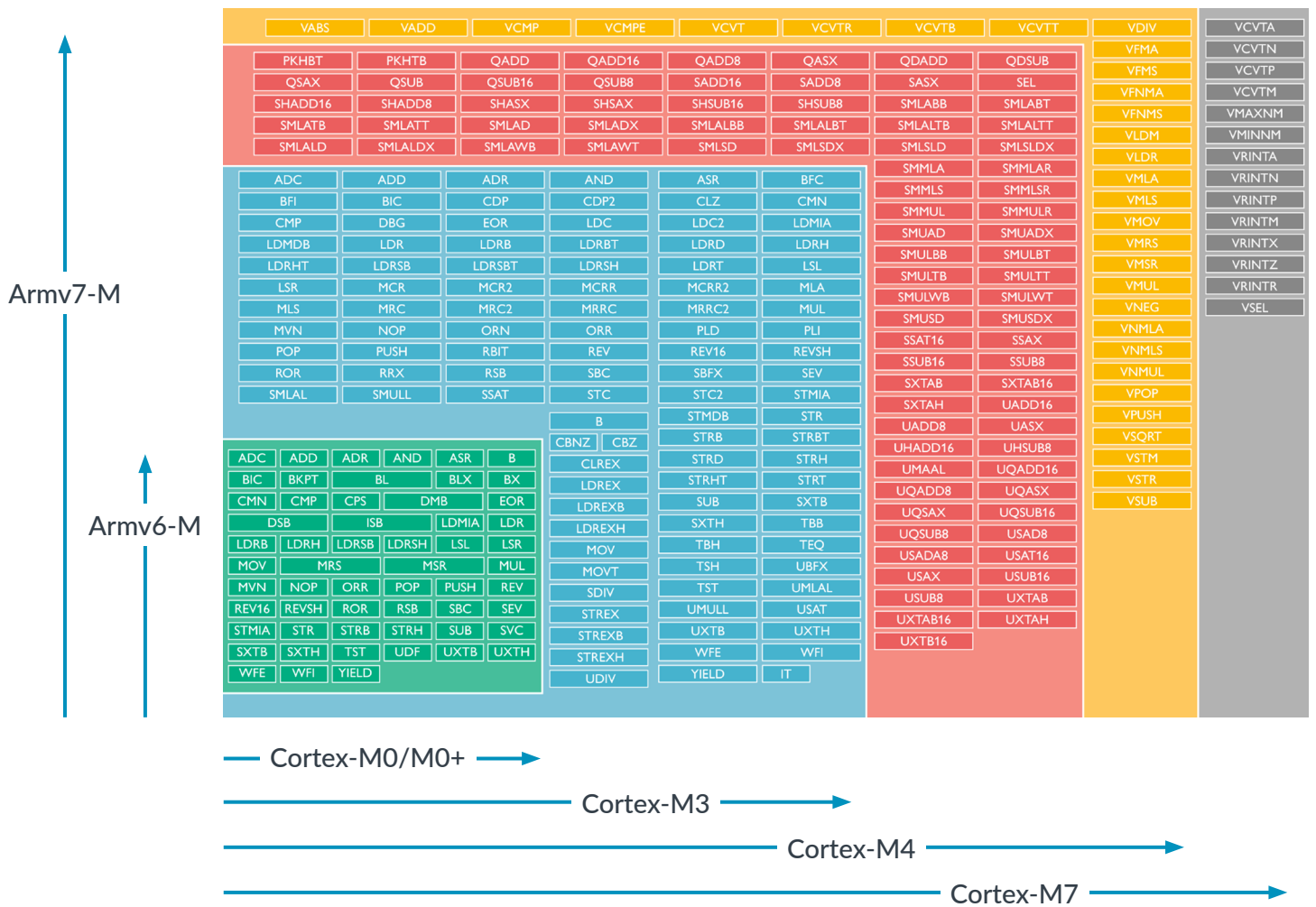
Figure 5: Instruction set